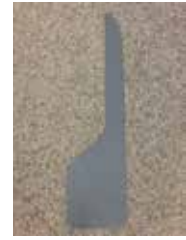
Long John Mud Flap Passenger's Side (1)