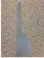
Long John Mud Flap Driver's Side (1)