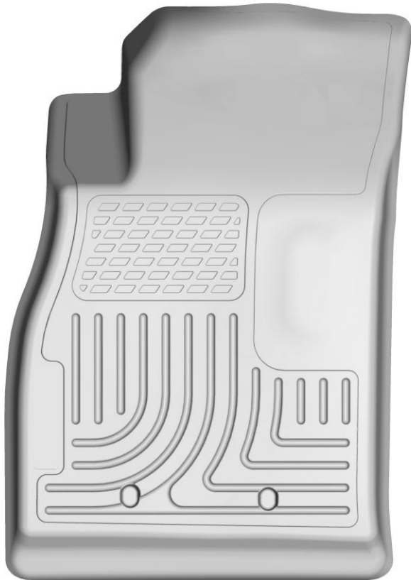
LEFT OR DRIVER' SIDE