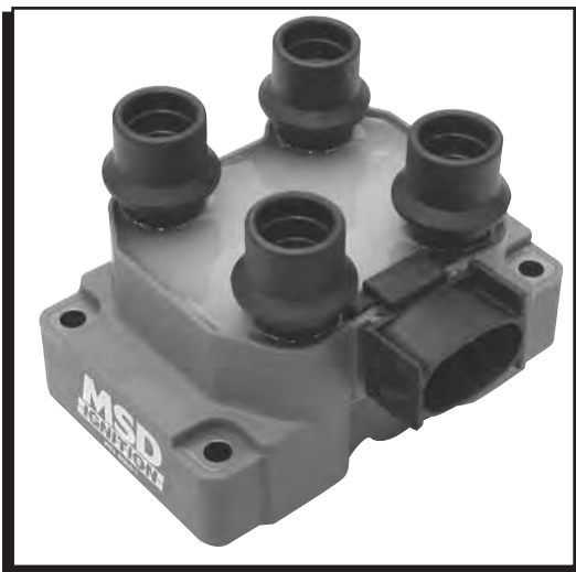
Figure 1 The MSD Ford 4- Tower Coil Pack.

WARNING: High Voltage is present on the coil terminals. DO NOT touch the coil terminals or tower when the engine is cranking or running.