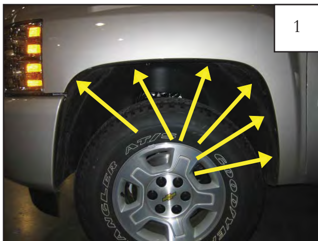
Remove six factory fasteners with a pry tool.