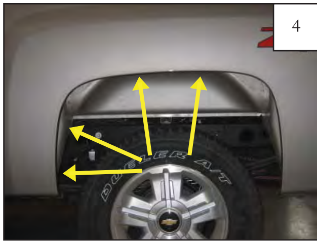
Remove four factory fasteners with a pry tool.