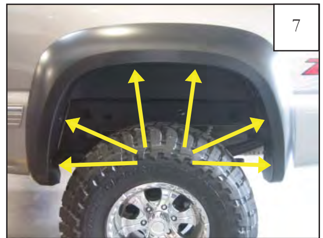
Install six tuflocks using a #2 stubby screwdriver.