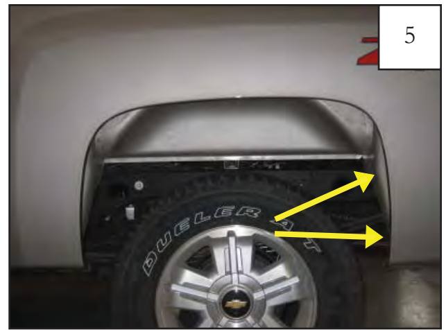
Remove two factory screws with a #2 stubby screwdriver.