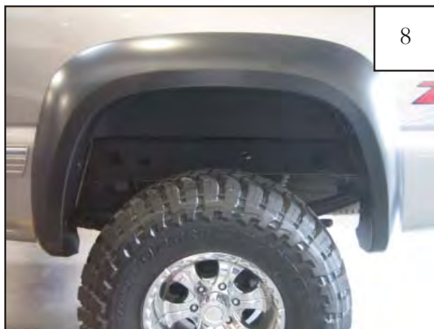
Completed rear flare installation.