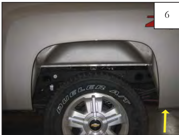
Remove one factory bolt with a 1/2" wrench.