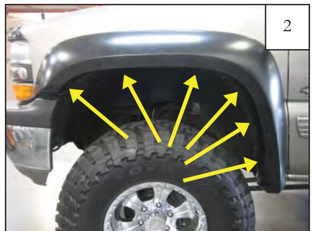
Install six tuflocks using a #2 stubby screwdriver.