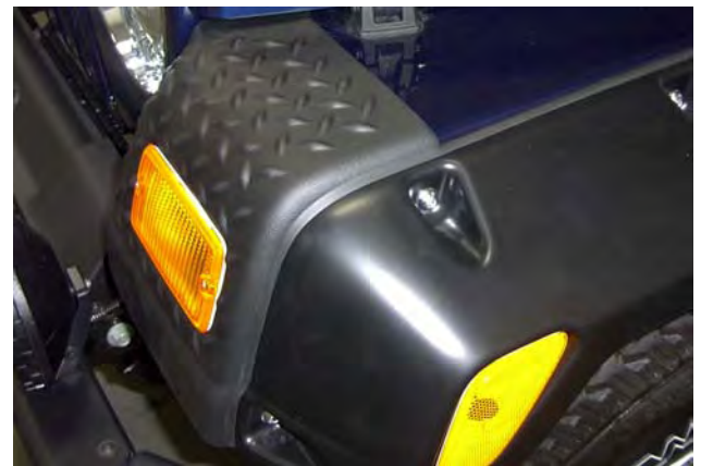
Photo #4 – Front Corner edge is under new Bushwacker Wiper-Style Edge Trim