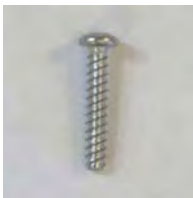
Plastite Screw (4 per)