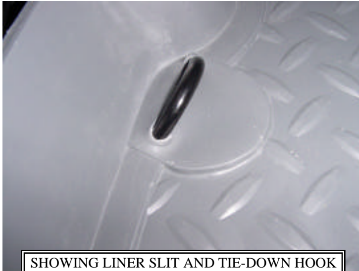
SHOWING LINER SLIT AND TIE-DOWN HOOK PUSHED THROUGH TO ALLOW ACCESS