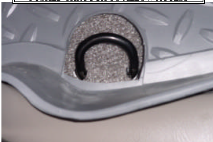
SHOWING RAISED AREA IN LINER TRIMMED AWAY TO ALLOW ACCESS TO TIE-DOWN HOOK