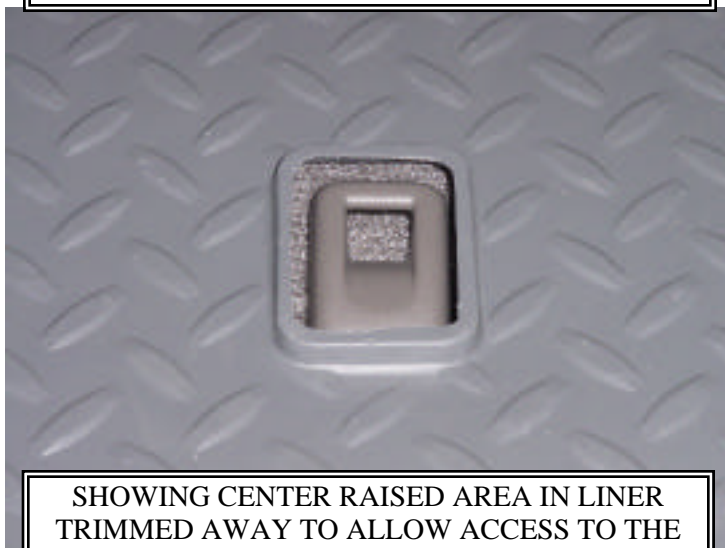
SHOWING CENTER RAISED AREA IN LINER TRIMMED AWAY TO ALLOW ACCESS TO THE CHILD SAFETY SEAT TETHERING POINT